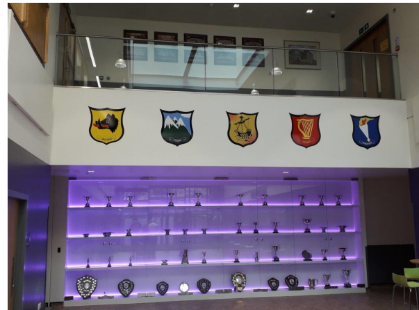
Trophy Cabinet in Main Entrance Foyer