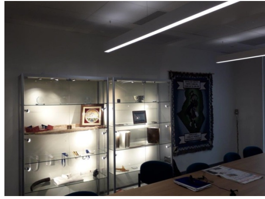
Conference Room – with gifts presented to OHS