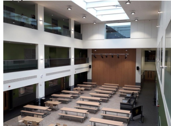
Atrium / Dining Area 1