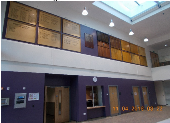
Legacy Dux boards in the Main Entrance Foyer