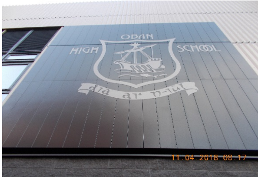
The school badge on the West elevation